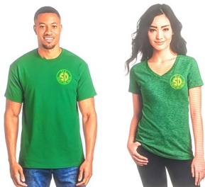
Yellow graphics over medium-dark green shirt

The Southern Division Board of Directors continues to offer SD Members the opportunity to purchase official division Crew- and/or V-neck shirts for themselves and their family and friends. A limited quantity remains, so don't miss out! Think of this purchase not only as a way to show support for your division at train shows. But when you wear your shirt elsewhere it just might encourage folks to ask you about the club, which just might lead to new TCA and SD members. It's a "win-win"! These shirts are available now to order , and the form is available on the SD website: tcasoutherndivision.org . And let us know if you're interested in baseball caps and/or visors. Thank you for your support.